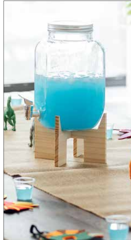
Dinosaur transforming formula is currently being tested by scientists.

Test subjects report amazing experiences and are eagerly lining up to try the potion again and again. Its creators remain focused on ensuring that their incredible discovery remains both safe and fun while they continue conducting experiments